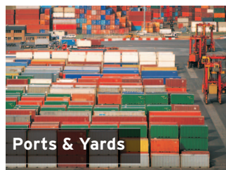
Ports & Yards